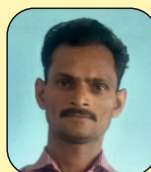
Sh. Pream Cleaner